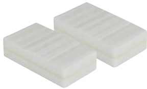
2 - Foam Seat Bottom Blocks (18" x 10" x 4" each)