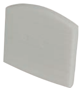
1 - Foam Seat Back Block (18" x 27" x 2")