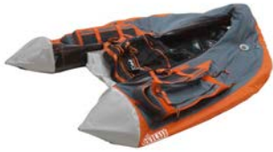
Fat Cat- LCS