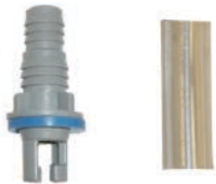
Summit 2 valve adapter Vinyl tube valve adapter