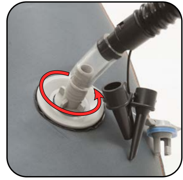
Pump, adapter, valve