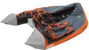
Fat Cat- LCS