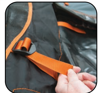
Ladder lock detail