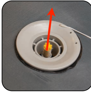
Stem up and closed