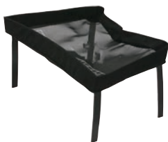
LCS Stripping Apron