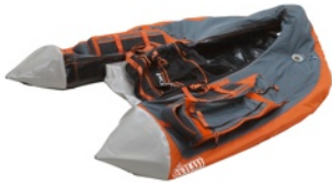
Fat Cat- LCS