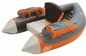
Fat Cat- LCS