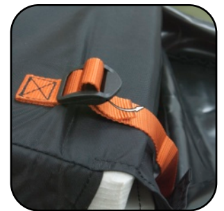
Ladder Lock Detail