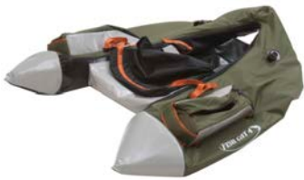
Fish Cat 4 - LCS