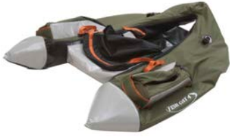
Fish Cat 4 - LCS