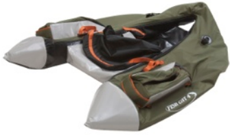
Fish Cat 4 - LCS