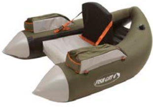
Fish Cat 4 - LCS